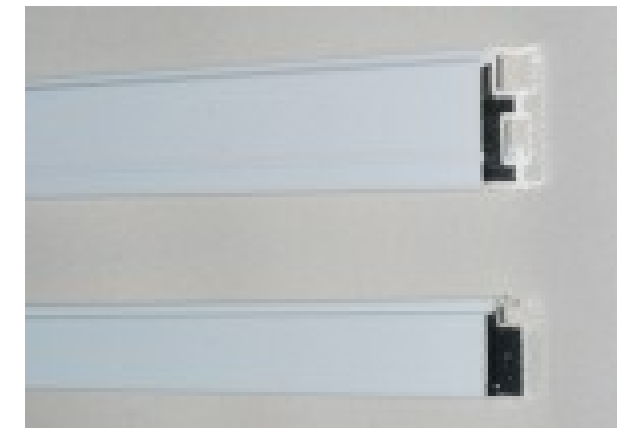
30MM EXTRUDED PROFILE

The hinges and turn buttons will add an additional 16mm each to the overall dimension.