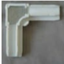
4 corner pieces

Each fly screen kit contains the following items