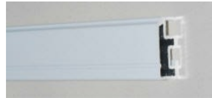
4 sections of Aluminium framing depending on screen size