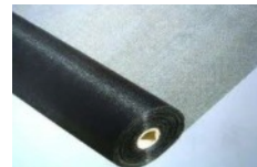
Fly mesh for 1 screen